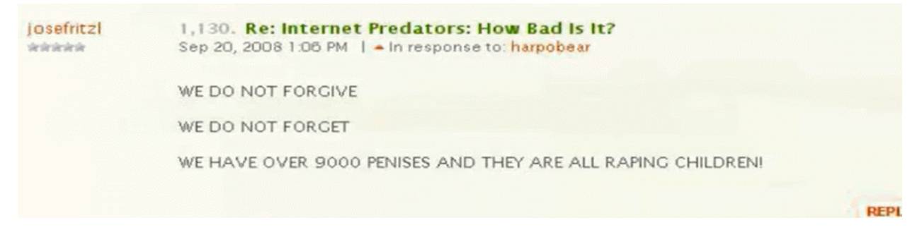
Figure 3. mainstream media failed to notice signals of trolling obvious to insiders.