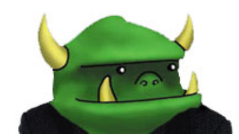
Figure 6. Well Trolled.